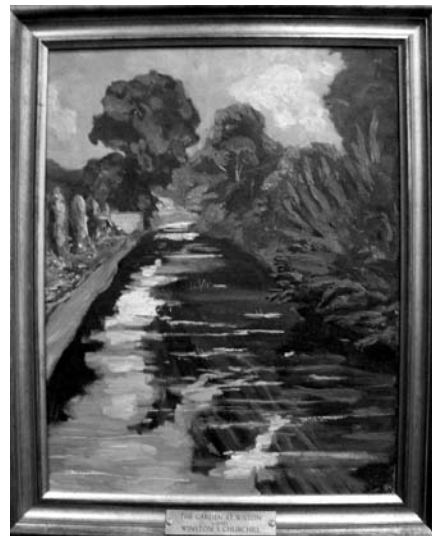
Churchill’s painting “The Garden at Wilton,” ca. 1935, oil on canvas