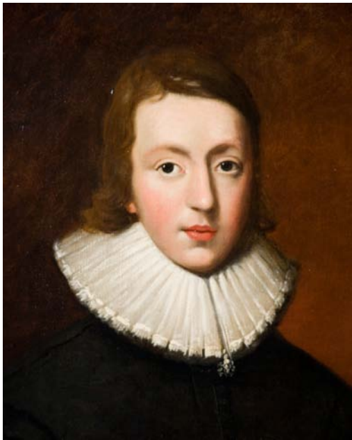
Portrait of John Milton