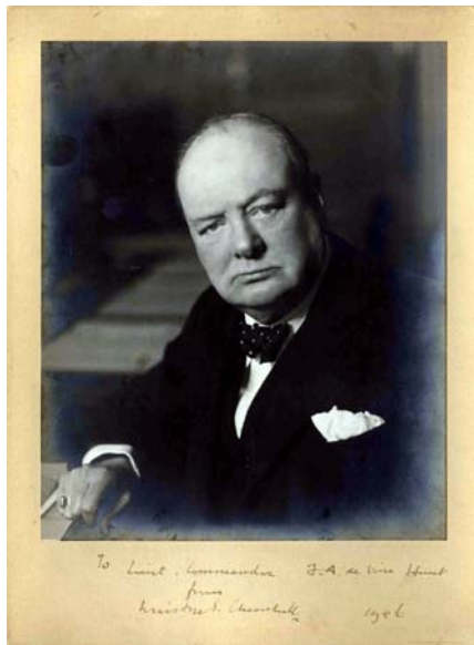
An inscribed photograph of Churchill taken during the war years

The O’Bryan Collection includes more than 80 volumes of Winston S. Churchill’s (1874-1964) writings published during his lifetime, many of which are first editions. Among these are: a rare copy of Churchill’s first book, The Story of the Malakand Field Force (1897), a true-life adventure story of British military activity on the Indian frontier; copies of Churchill’s only novel, Savrola (1899); several of his books on the Boer War in South Africa; signed presentation copies of his multi-volume biography of his ancestor, the Duke of Marlborough; and his multi-volume histories of the first and second world wars.